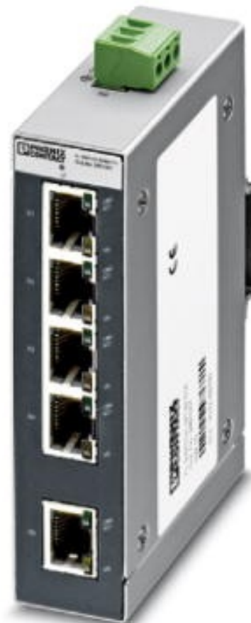
Figure 2. 5-Port 10/100 Base TX DIN Rail Mounted Ethernet Switch (P0972WE)

For detailed physical and electrical specifications, refer to Model SFNB 5TX 2891001 at www.phoenixcontact.com/us/products .